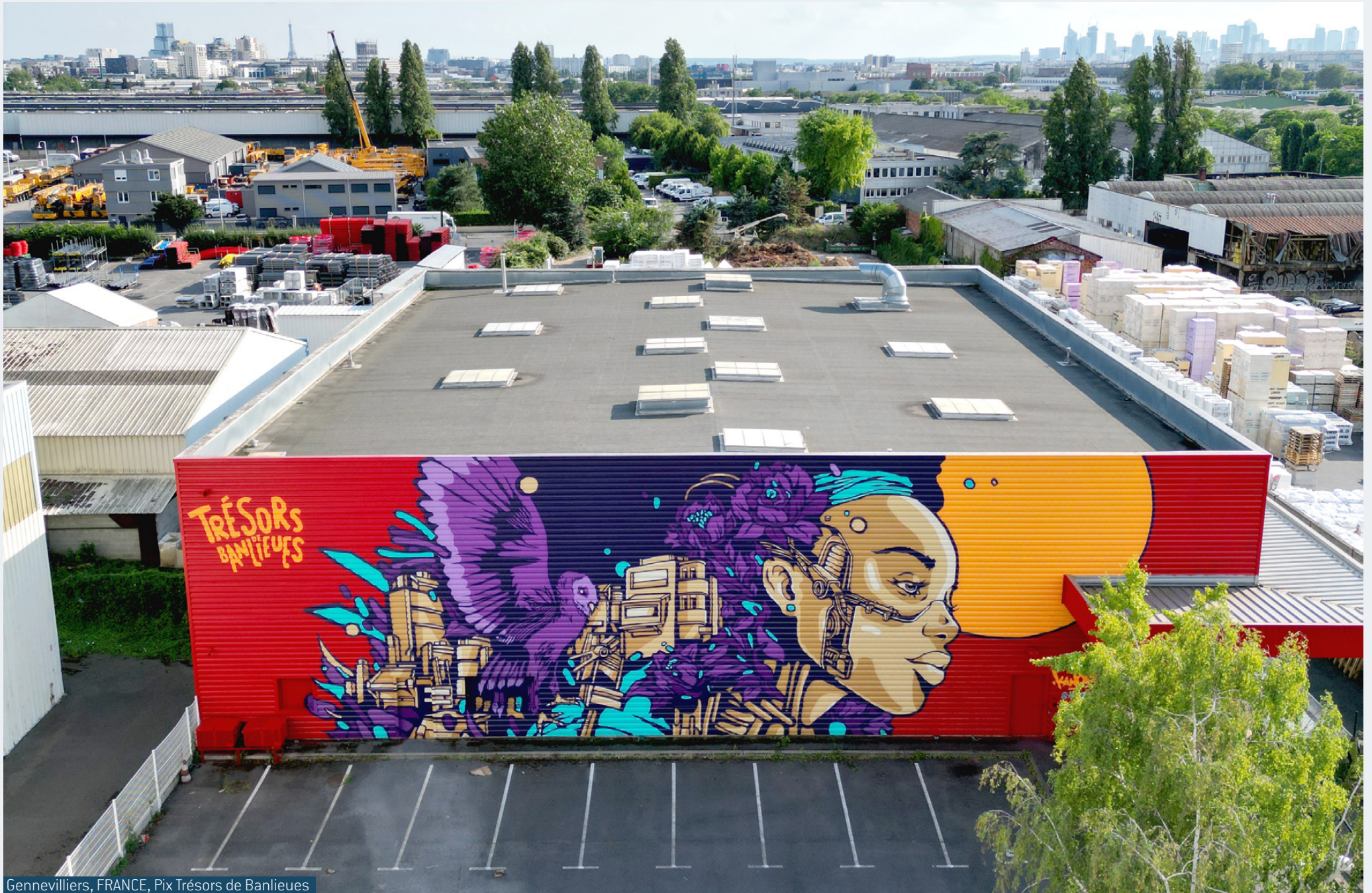
Gennevilliers, FRANCE