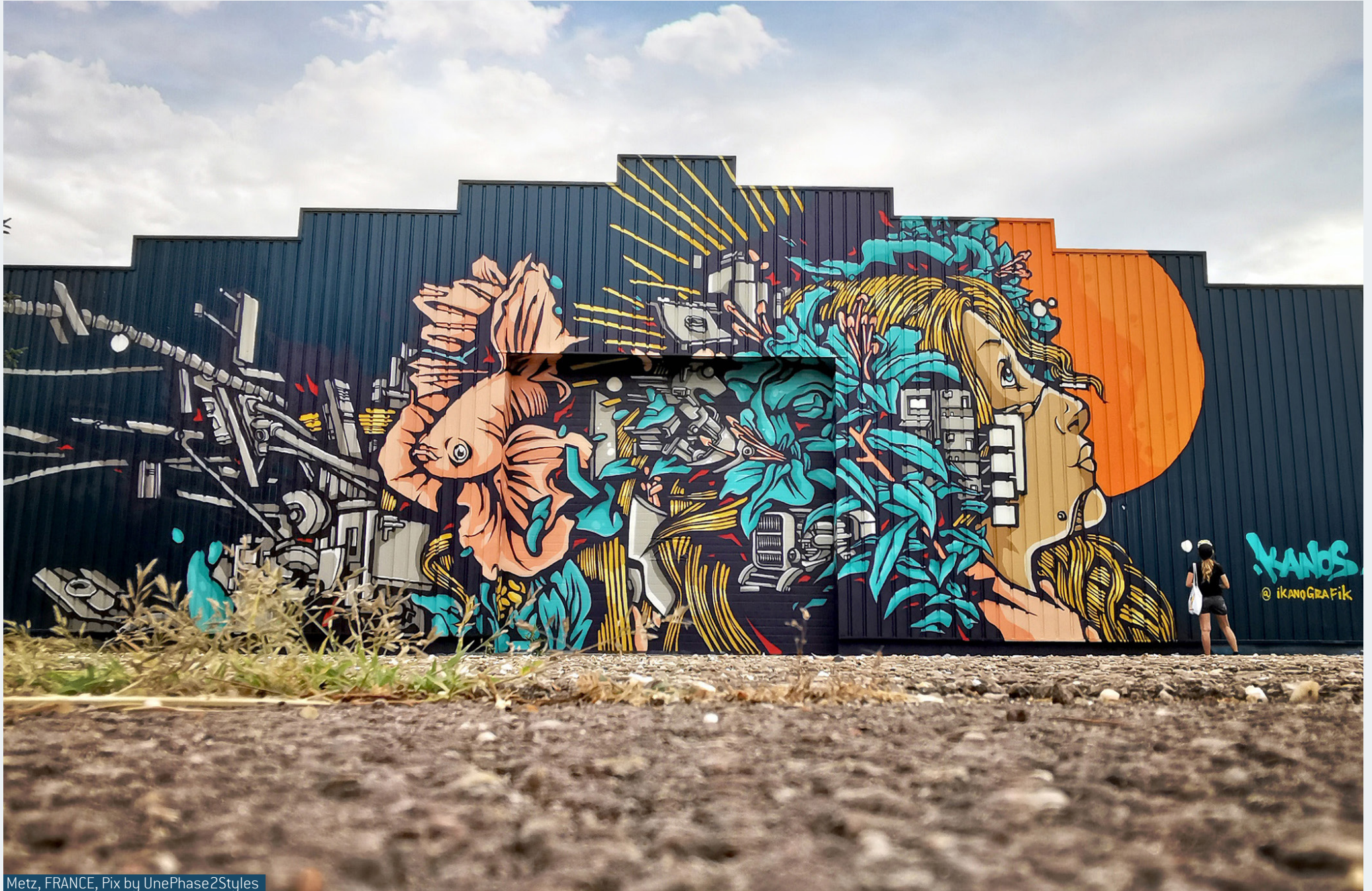
Metz, FRANCE, Pix by UnePhase2Styles