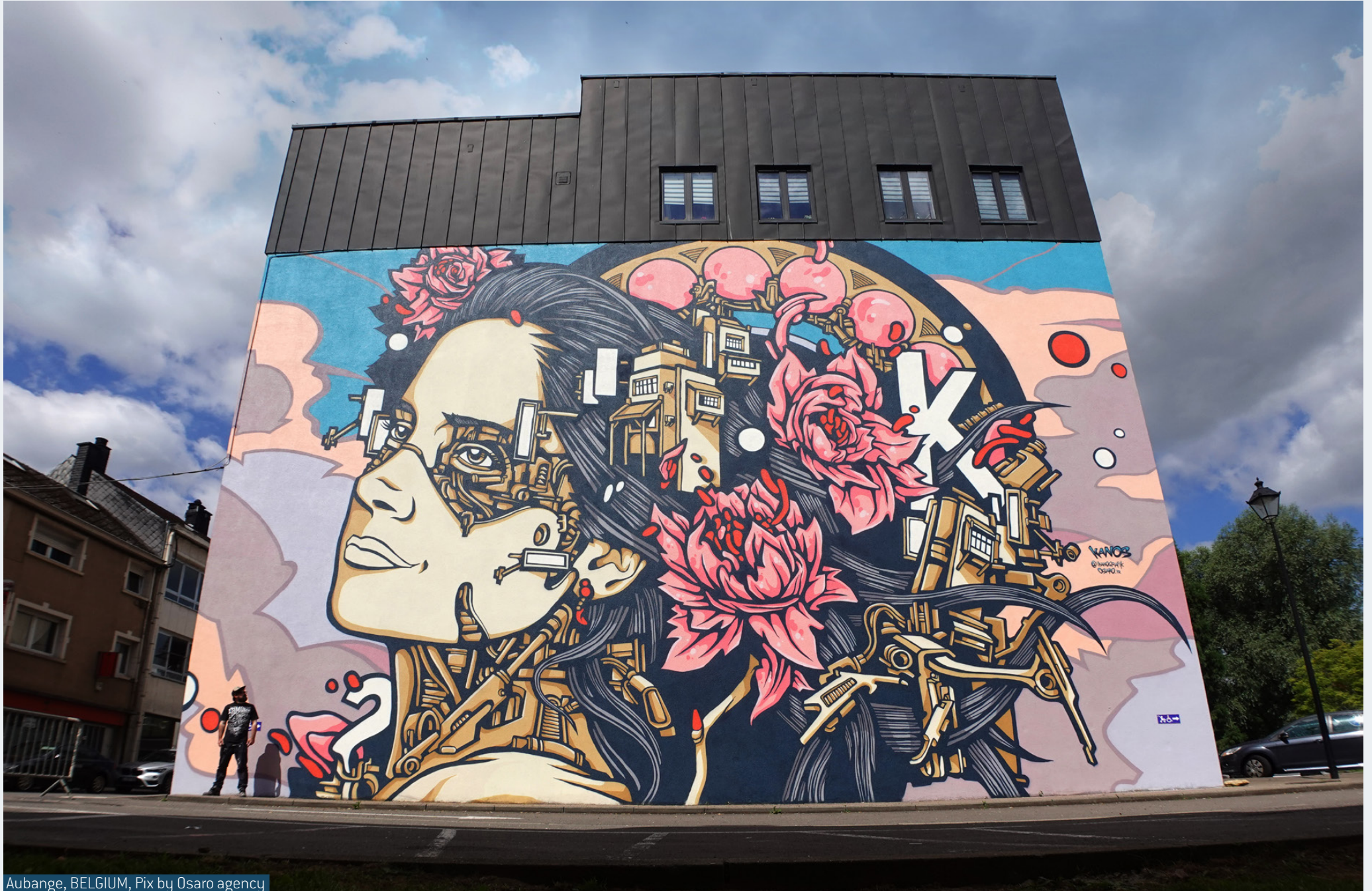
Aubange, BELGIUM