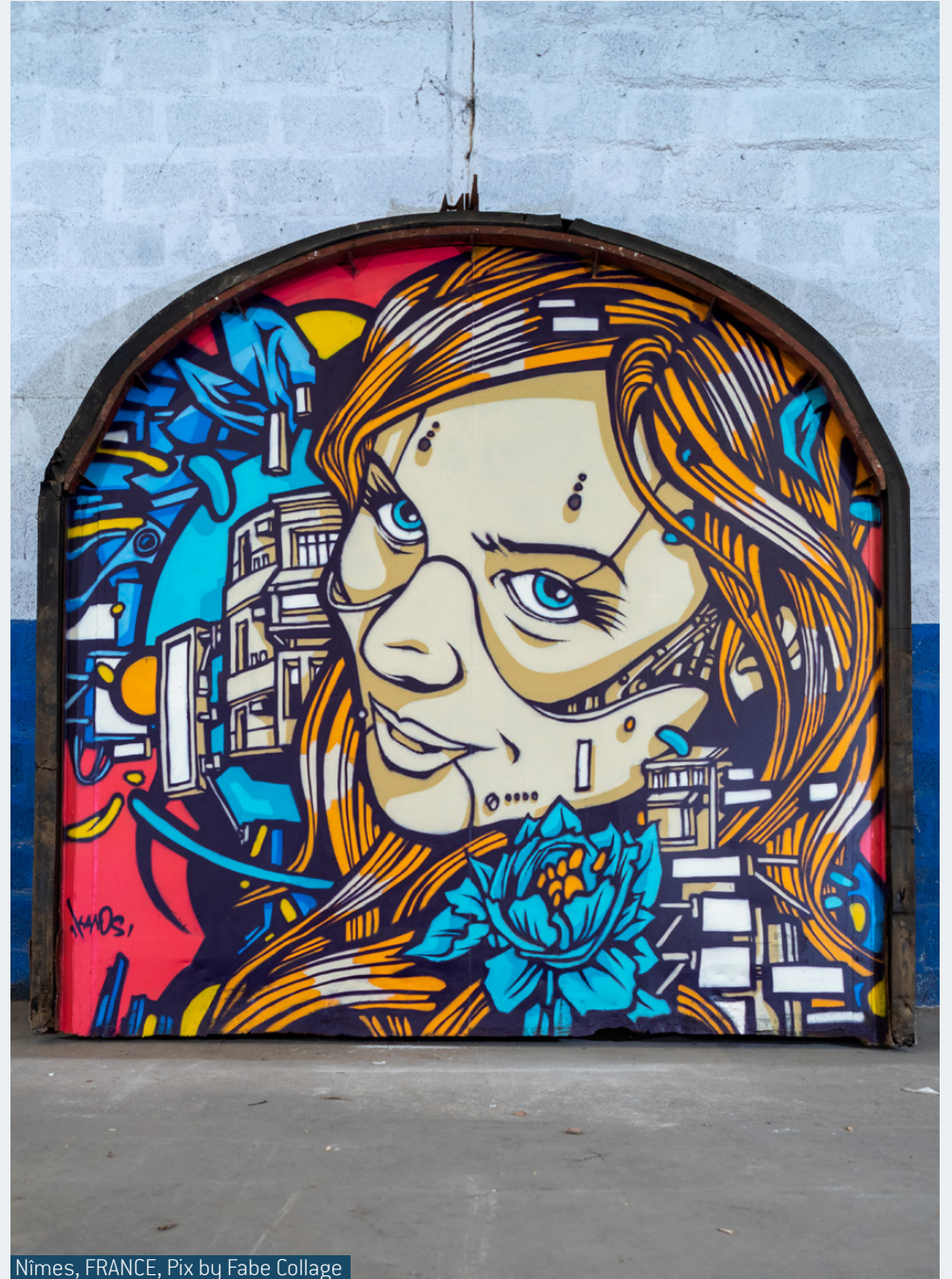
Nîmes, FRANCE