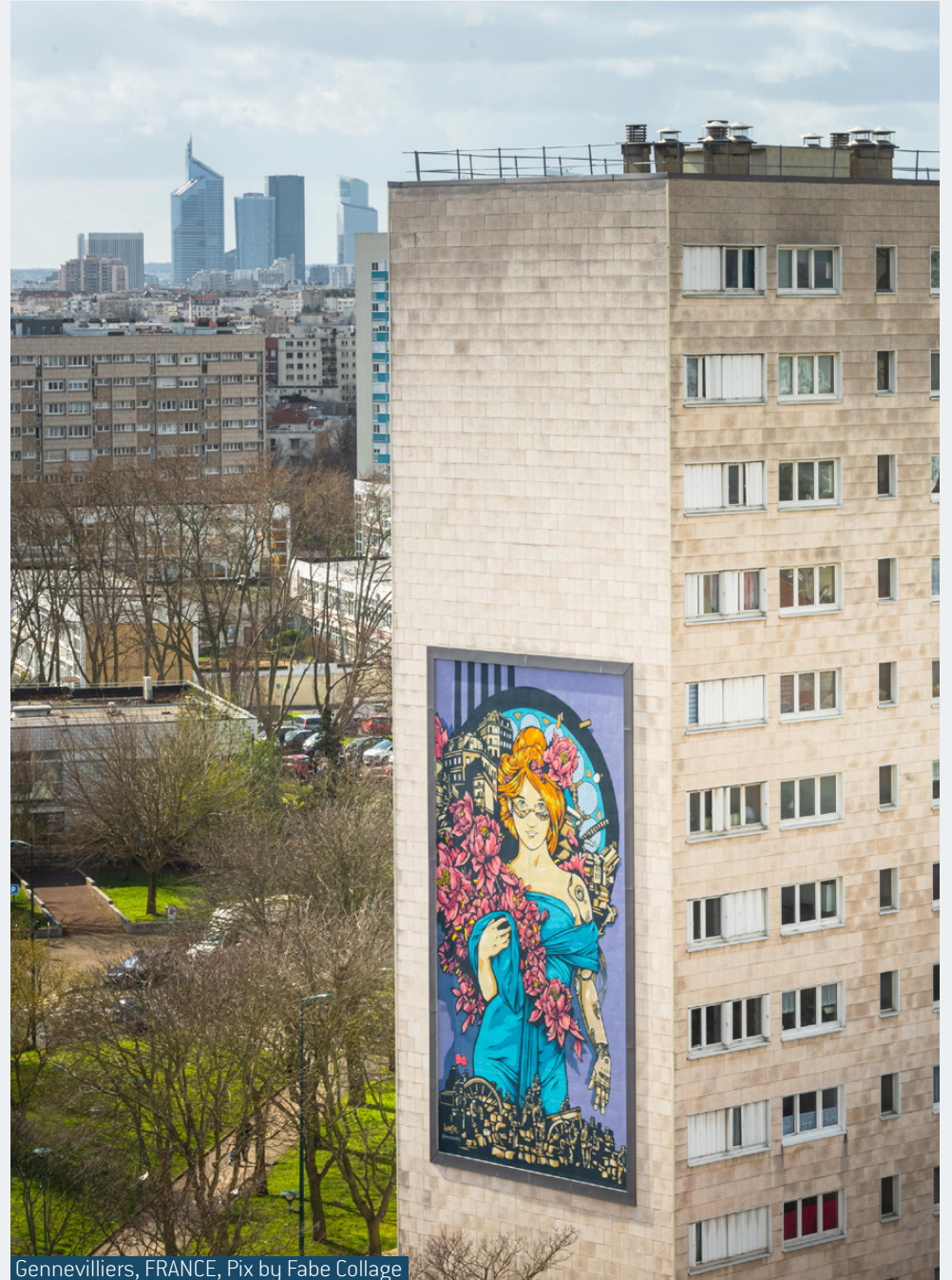
Gennevilliers, FRANCE