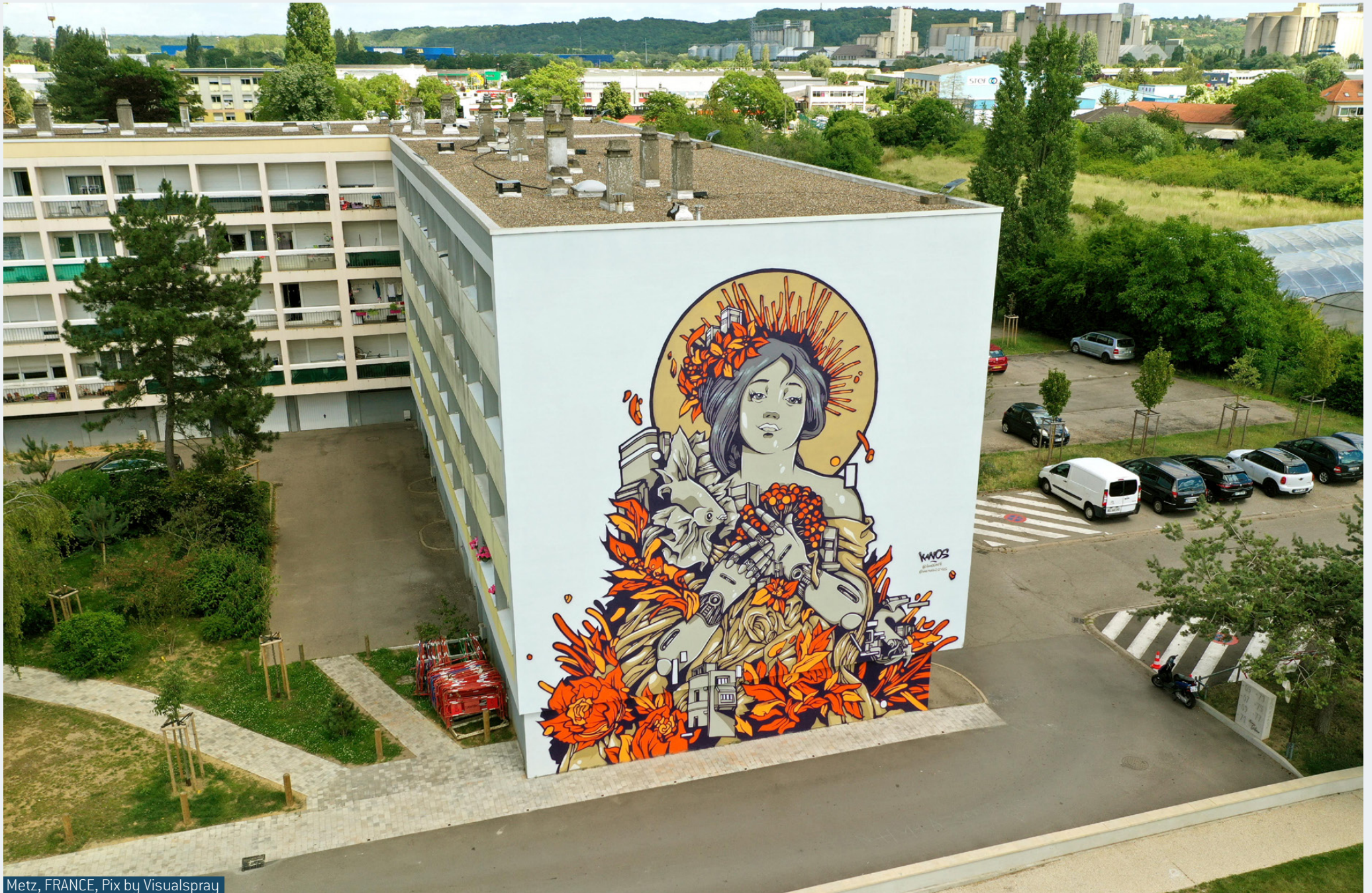
Metz, FRANCE, Pix by Visualspray