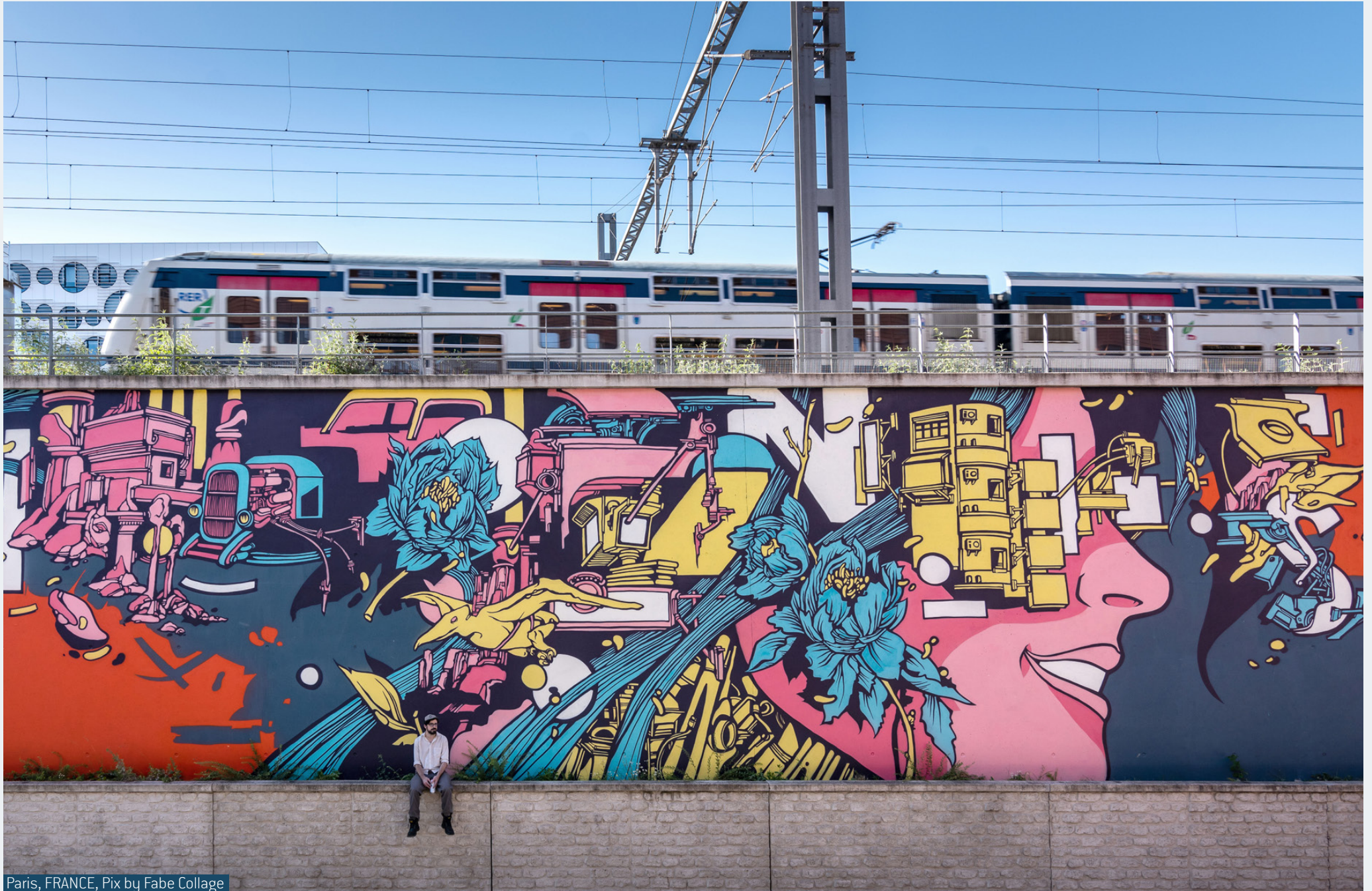
Paris, FRANCE, Pix by Fabe Collage