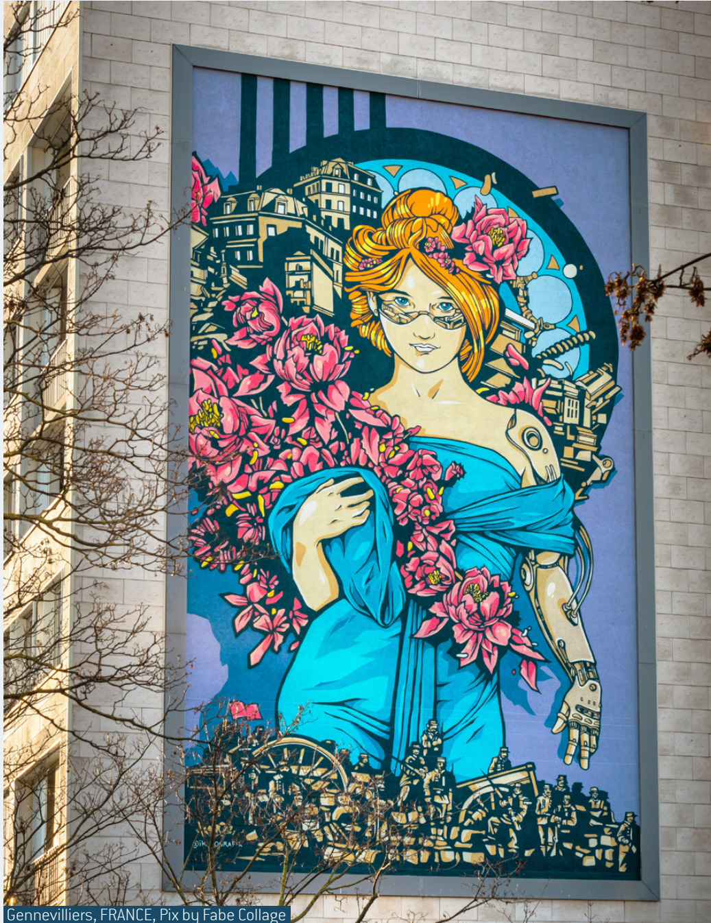
Gennevilliers, FRANCE, Pix by Fabe Collage